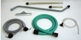
ARU STD Tools and Accessories - Included