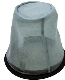
Liquid Filter - Included