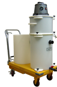
2D-ARU-15 STD (HY-C) MRAC