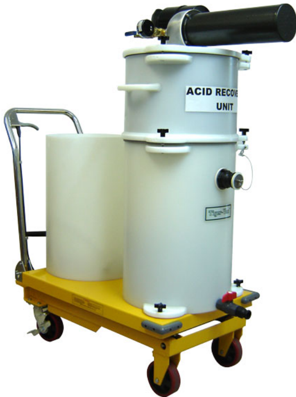
CS-ARU-15 STD (HYC) Shown