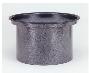
Activated Carbon Cartridge - Optional