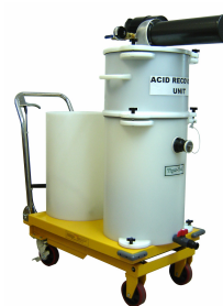
CS-ARU-15 STD (HY-C)