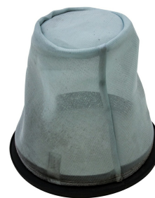
Liquid Filter - Included