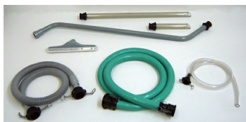
ARU STD Tools and Accessories - Included