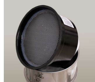
Activated Carbon Cartridge for Mercury Recovery - Included