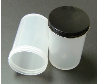
Jar for Mercury Recovery, 20 oz (540 ml) with lid - Optional