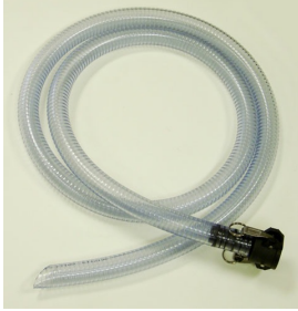
Clear Suction Hose Assembly for use with Mercury Separator - Included