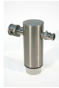
Mercury Recovery Separator with Jar - Included