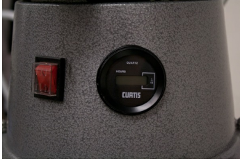
Hour Counter for MRV models - Included