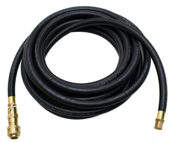
Air Supply Hose Assembly, Static Dissipative and Conductive - Included