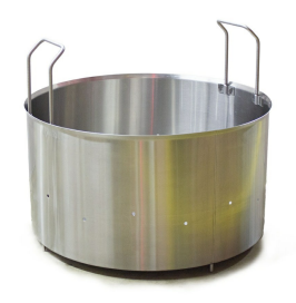
Sieve Basket - Included