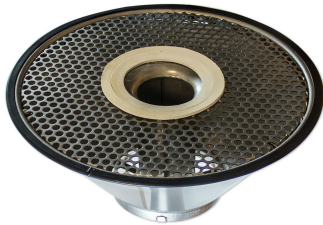
Cone for Interceptors - Included