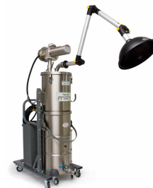
Optional Dust Extractor Arm