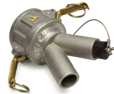
Wye Connector - Included