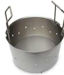
Sieve Basket - Included