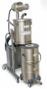
SS-IT (85L) EX (CFE) HEPA with Recovery Tank removed