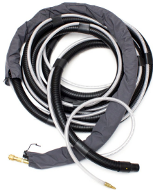
Suction/Airline Hose Assembly, Static Dissipative and Conductive - Included